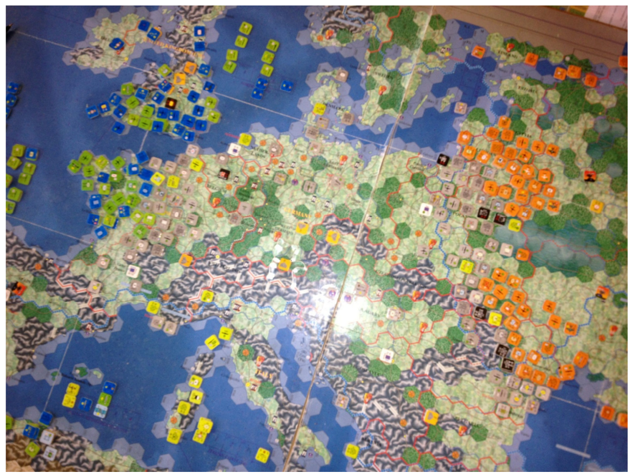
Europe at the Beginning of Summer 1944