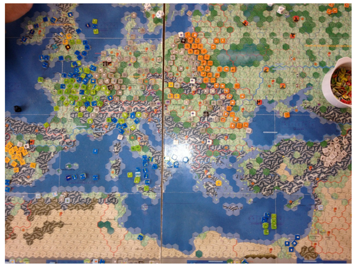
Europe at the end of ND44