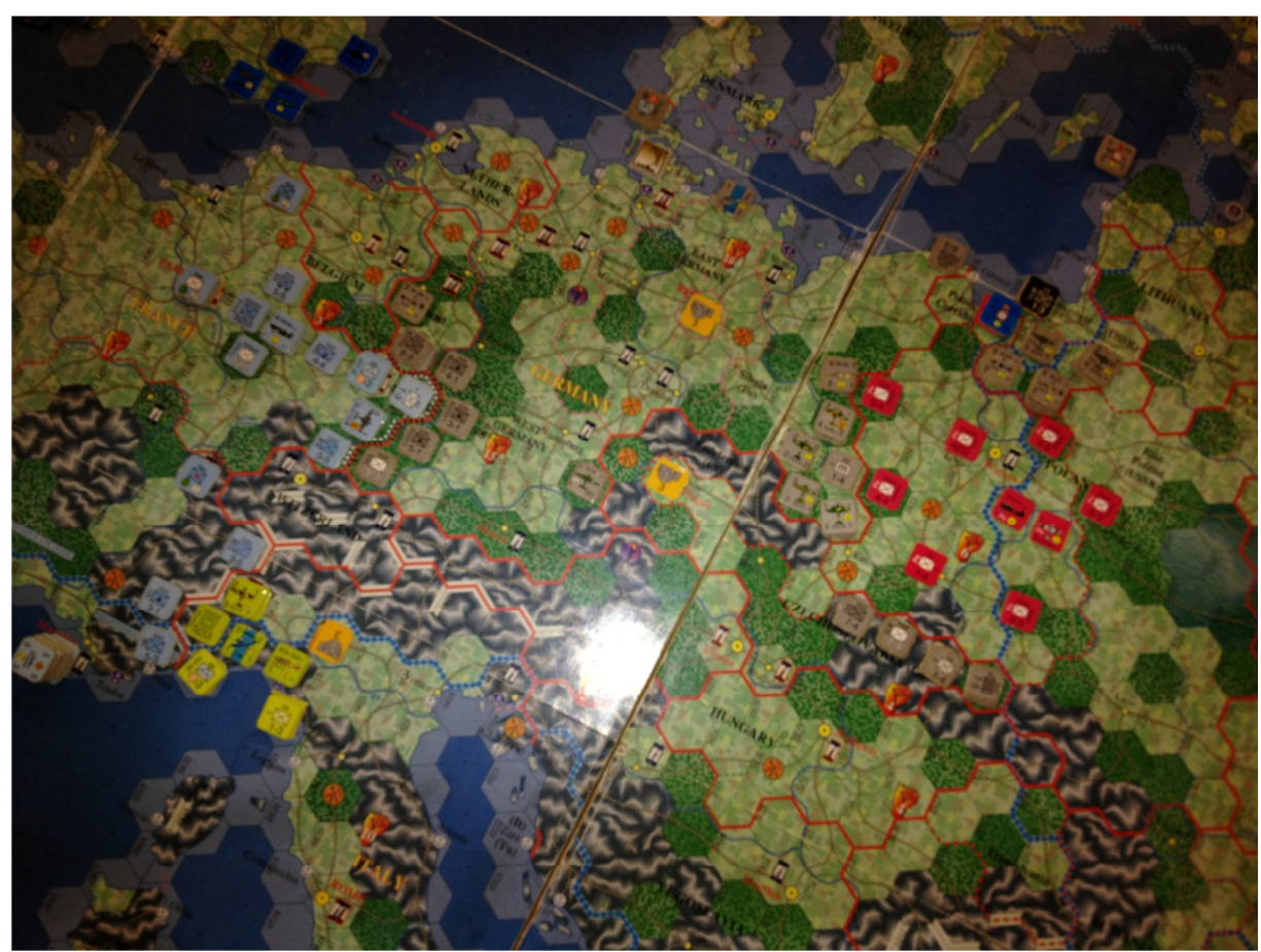
Set-up in Europe (including the DOW on Poland)

Germany did a Poland first setup with some divisions against Denmark and a small group at the Yugioslawian border. Italy setup against France and breaks down her MTN.