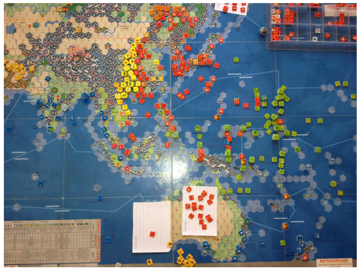
Asia at the End of 1944 (in Manila it's a Japanese TER)

We ended the game wirth the ND44 turn. Both sides claiming victory :-)