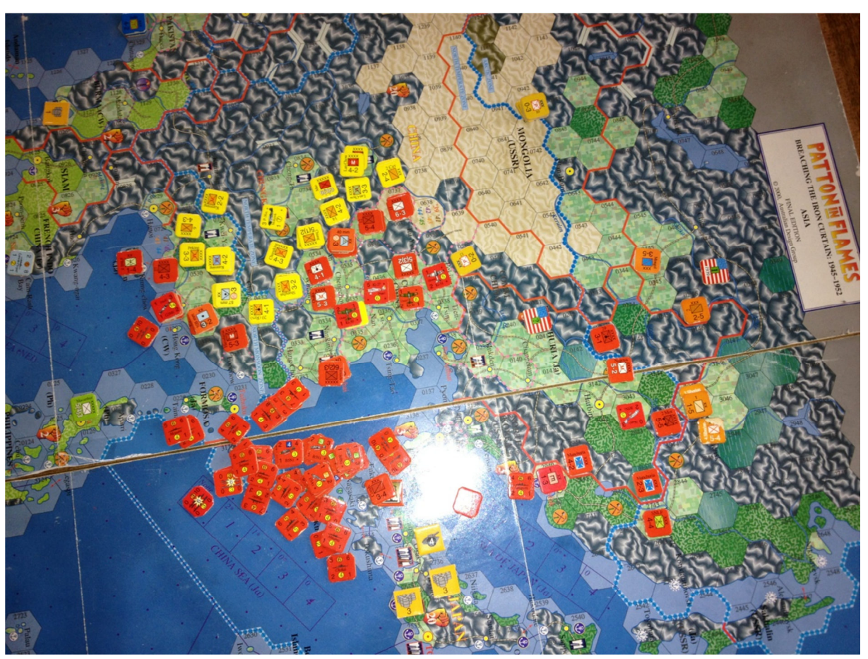
Asia after the Russian "capitulation"

Only some Samurai-Shuffling this time in southern China.