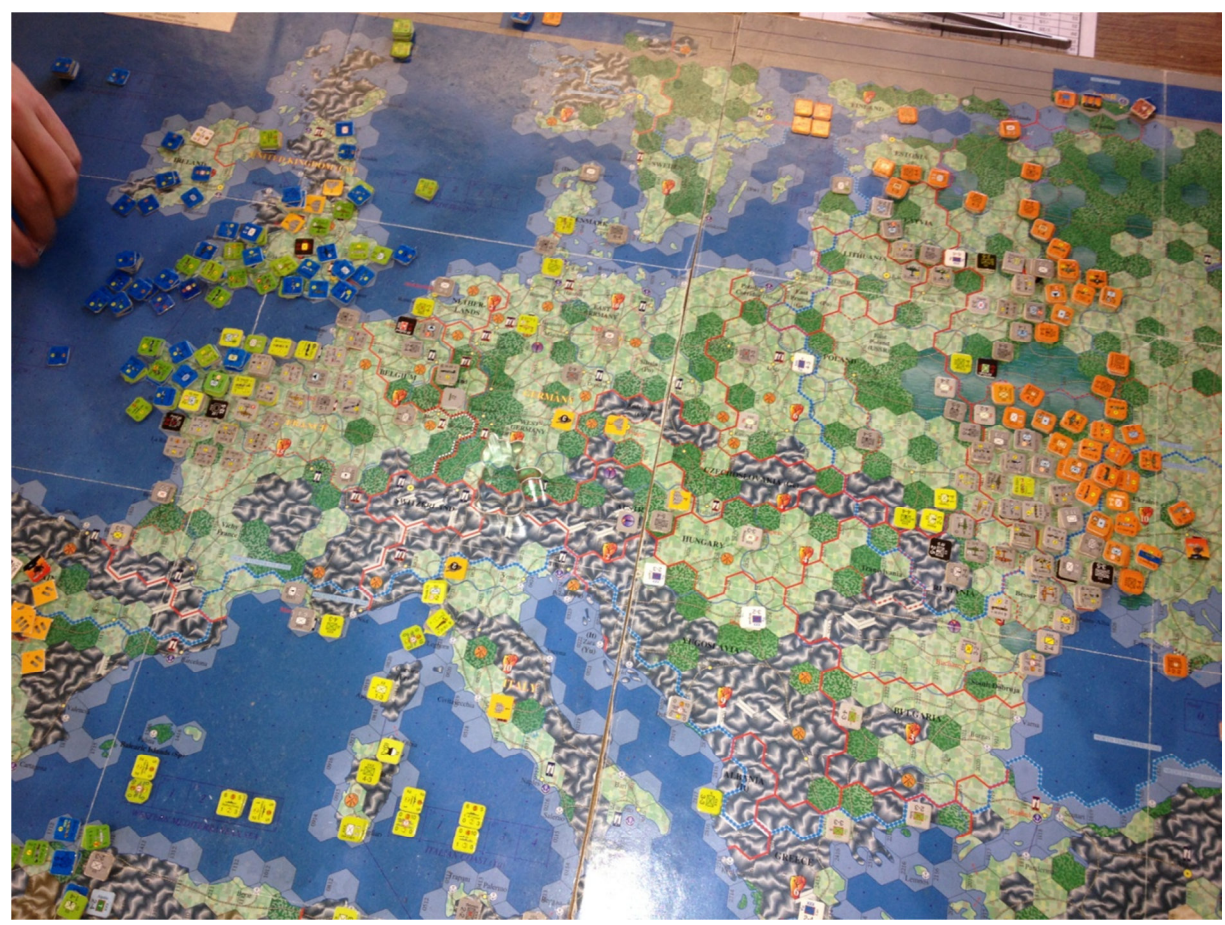
Europe at the End of 1942

Operation Roundhammer occupies Brest. The First attack on Nantes (+10) failes.